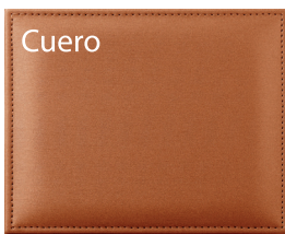
牛皮 Niú pí