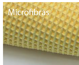
微纤维 Wēi xiān wéi