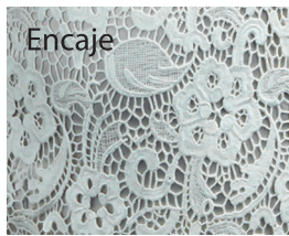
花边 Huā biān