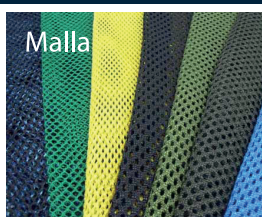
网织 Wǎng zhī