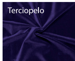
丝绒 Sī róng