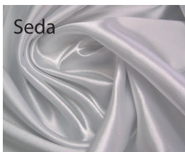
丝绸 Sī chóu