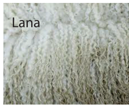
羊毛 Yáng máo