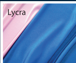
莱卡 Lái kǎ