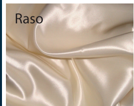
缎面 Duàn miàn